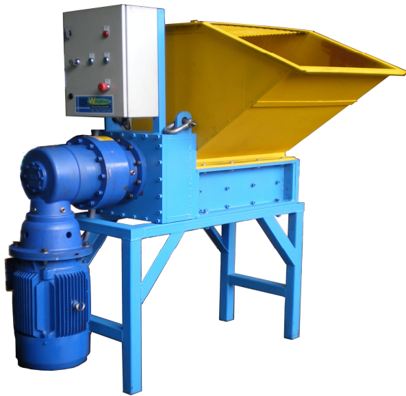
Breaker Model :MPS-30