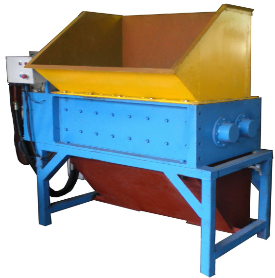
Breaker Model :MPS-70

香港廠：新界元朗洪水橋田心路 17 號 A 17A Tin Sam Road, Hung Shui Kiu, Yuen Long, HK 電話：2445 3555 傳真：2146 1126 網址：www.wingbest.com.hk